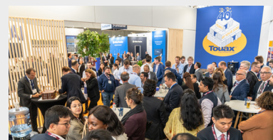
Great celebration at Intermodal Europe with a delicious Birthday cake