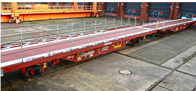
Refurbished 2 axle wagons into twin wagons

Our Indian fleet's utilization rate remains at 100% with a still long average remaining maturity of the lease.