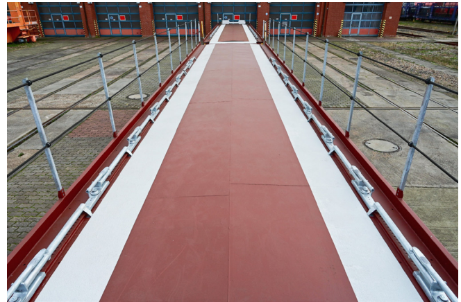
Twin wagons for commercial vehicles transportation

Beside the usual finished vehicles segment, we also started serving manufacturers of commercial vehicles (vans) thanks to the modification of existing 2 axle wagons into twin wagons.