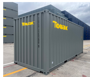
Touax Containers ready to be deployed

Constant deployment of new containers, successful management of depots stocks for both the leasing and resale activities...our fleet is growing and our utilization rates is back to around 96%, letting us foreseeing a positive 2024!