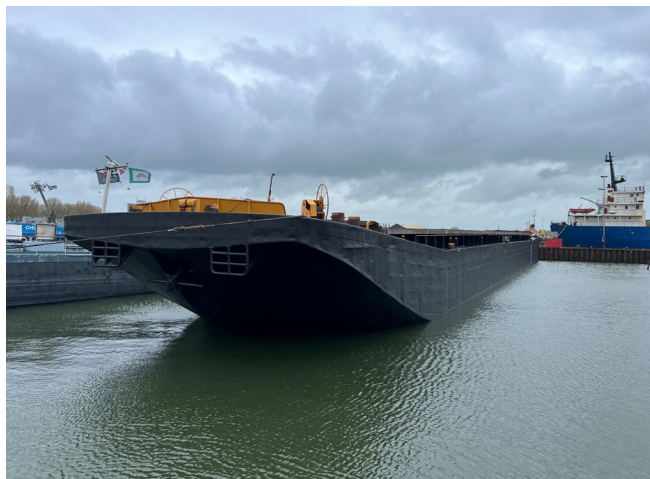
Latest acquisition: the 106 th barge of Touax fleet

For the time being the 2023 figures are not yet out, but we are confident about an improvement as we could already witness a positive dynamic for the dry bulk sector, especially the agricultural products as well as for the building materials which recovered after the 2022 drop.